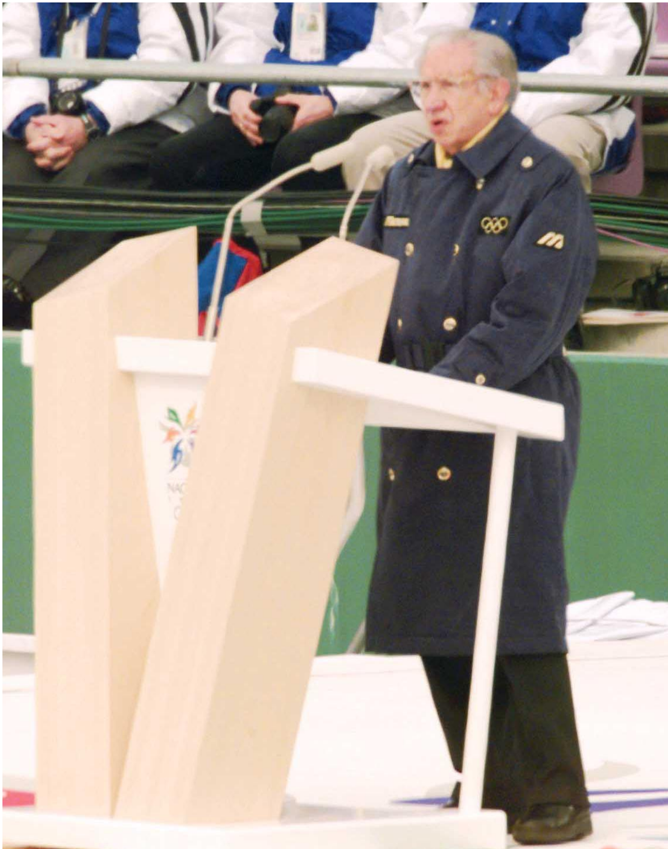
IOC President Samaranch addressing the Olympic opening ceremony.

The 18th Olympic Winter Games got under way with a dash of Japanese style Saturday as sumo wrestlers and local residents performed traditional rituals designed to drive away the evil spirits and purify the host city in central Japan.